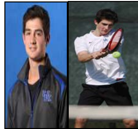
MAKS GOLD KCD 2010 MENS TENNIS UNIVERSITY OF KENTUCKY WILDCATS 13 CAREER SINGLES WINS